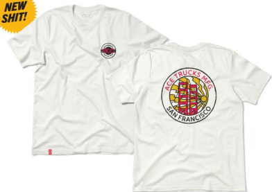
SKATE CITY WHITE