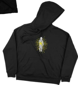
PORTAL HOODIE PREMIUM 10 OZ. MID WEIGHT COTTON.POLY SOFT HAND INKS SIZES: SMALL - XXL