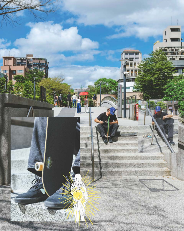
PORTAL G5 BLACK 9" X 33.5"