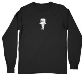
MEME LONG SLEEVE BLACK