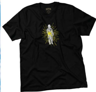
PORTAL TEE PREMIUM 100% COTTON SOFT HAND INKS SIZES: SMALL - XXL