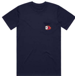
COMBUST POCKET TEE NAVY