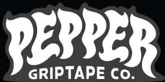
PEPPER WHITE/CLEAR - 5" PACK OF 20