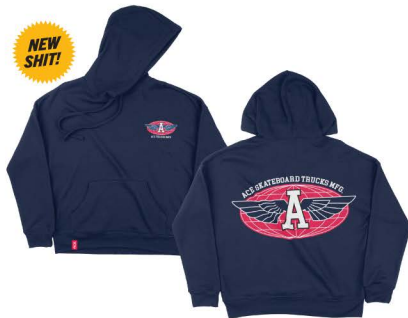
2007 PULLOVER NAVY