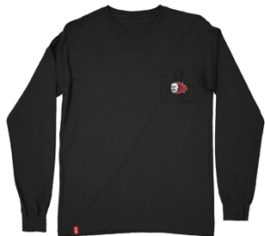
COMBUST POCKET TEE BLACK

100% PREMIUM COTTON UNLESS OTHERWISE NOTED / SOFT HAND INKS / UNISEX SIZES: S - XXL