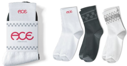
CREW SOCK 3 PACK