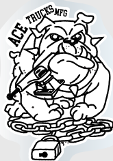
3.5" BULLDAWG STICKER