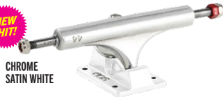
CHROME SATIN WHITE