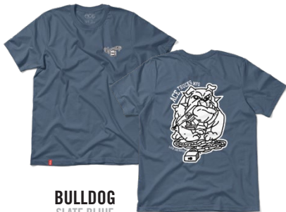
BULLDOG SLATE BLUE