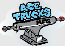
3.5" SKETCH STICKER