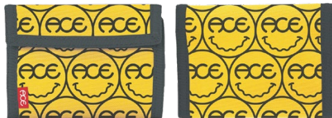
FEELZ VELCRO TRIFOLD WALLET