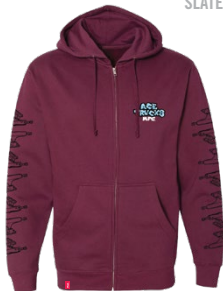
SKETCH FULL ZIP MAROON