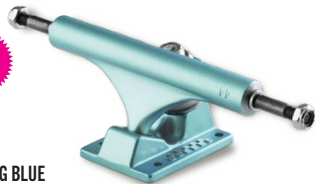
BIRD EGG BLUE