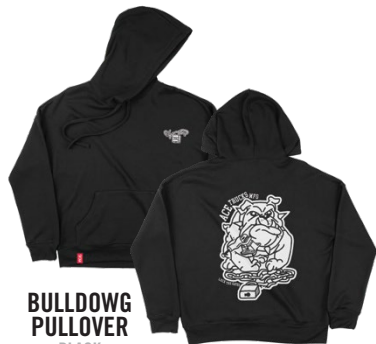
BULLDOG PULLOVER BLACK