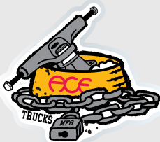
3" DAWG BOWL STICKER