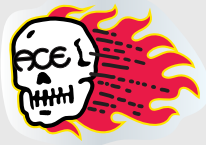
3.5" COMBUST STICKER